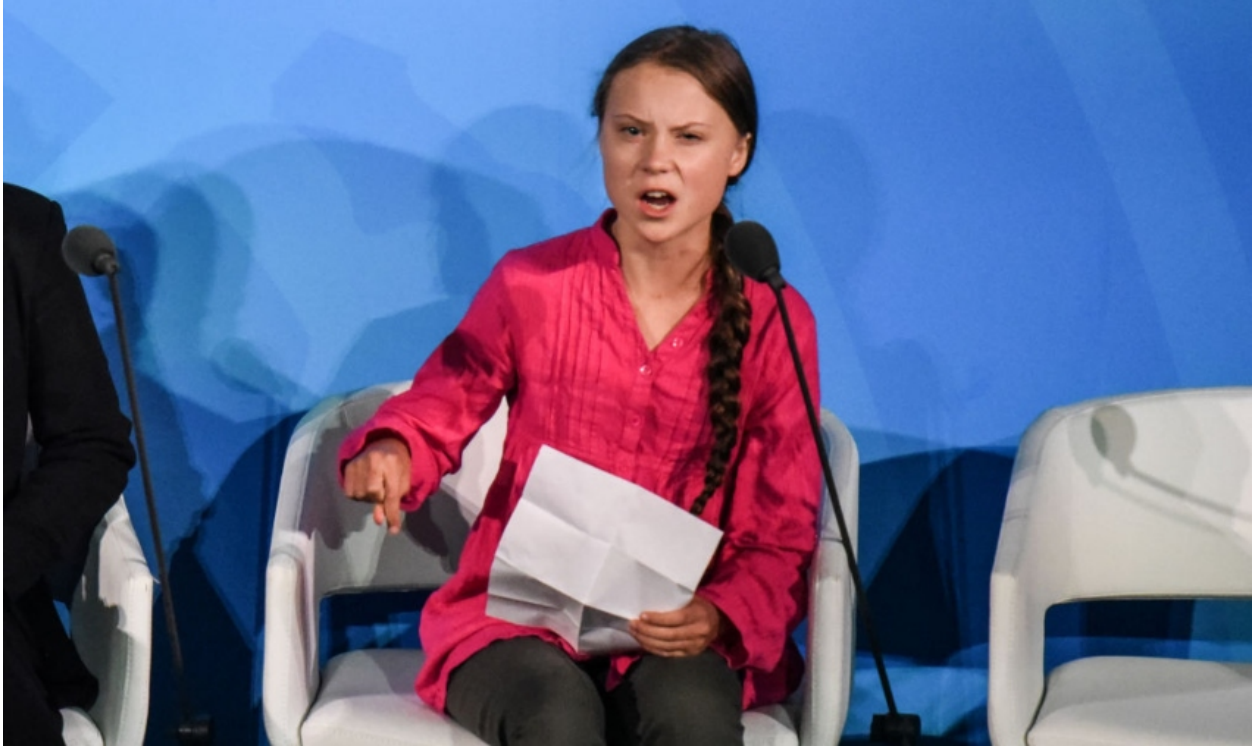
Greta, 16, addresses the United Nations

Generally, sermons are posted on our website shortly after the service at: http://www.knoxchurch.co.nz/sermons.html Hard copies of the sermons are available before and after the service – ask the person at the door.