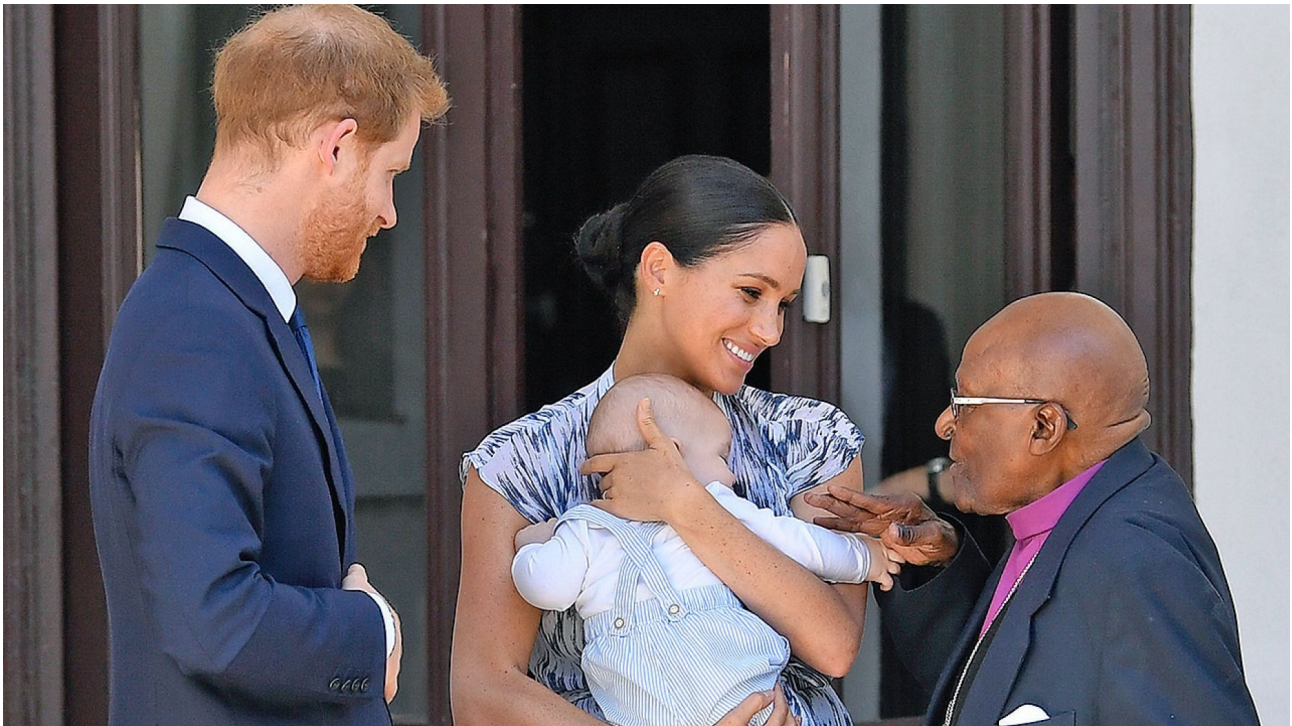
Harry and Meghan talk with Desmond Tutu, 87